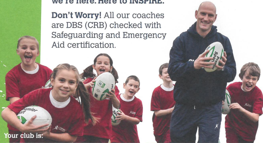
Your club is:

Don't Worry! All our coaches are DBS (CRB) checked with Safeguarding and Emergency Aid certification.