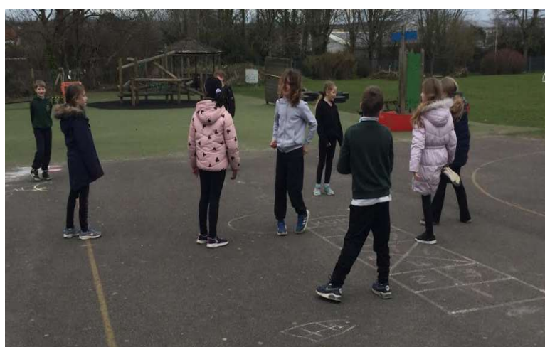
Iceni class have been practicing team building skills outside on Thursday afternoon. They have also done a great job practicing their singing for the upcoming Wessex music festival. We are really looking forward to joining other schools next Tuesday. We know our year four class will be singing superstars!