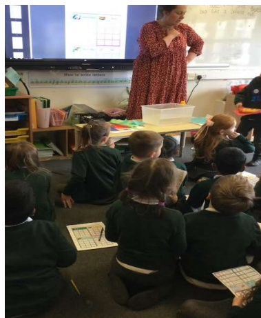
Shire class have been testing what would be the best material to build a kite with.