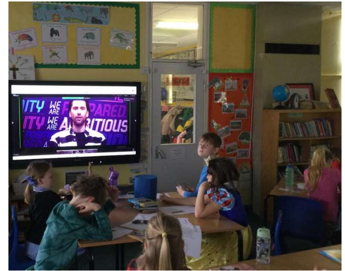
Iceni class took part in a "Footy hooky quiz" on World Book Day.